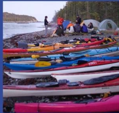
SEA KAYAKING EXPEDITION: rising 8-10th graders