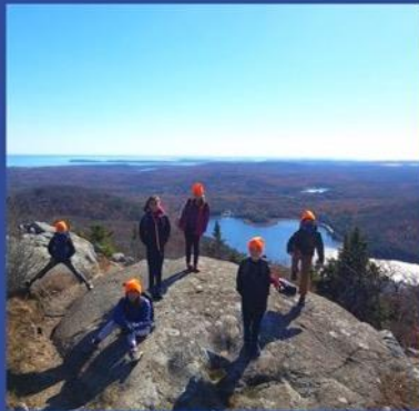
BEST of the MIDCOAST: rising 5TH & 7TH graders