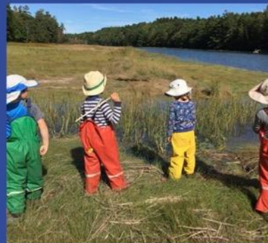
EXPLORERS CLUB: 1-2 graders + 3-4 graders