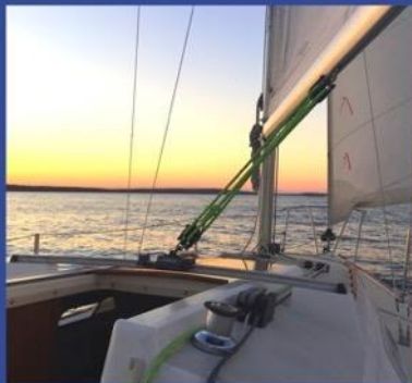
SAILING EXPEDITION: rising 9TH graders